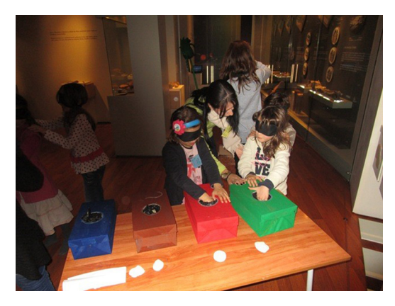
Figure 5. Touch station - exploring different textures linked to the permanent exhibition of the MCCB.