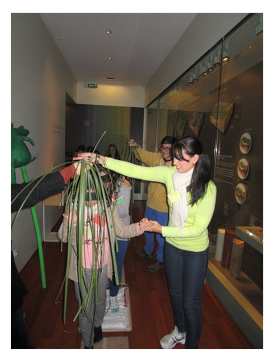
Figure 4. Participants experiencing a sensory carpet inside the museum.

Both activities at the Museum of Batalha Concelhia Community had a large membership from visitors. The first action described in this study was widely praised by the teachers who accompanied the group of visitors. Teachers commented on the relevance