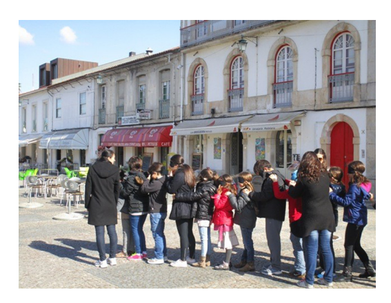
Figure 6. Visit to the Vila with blindfolded children.